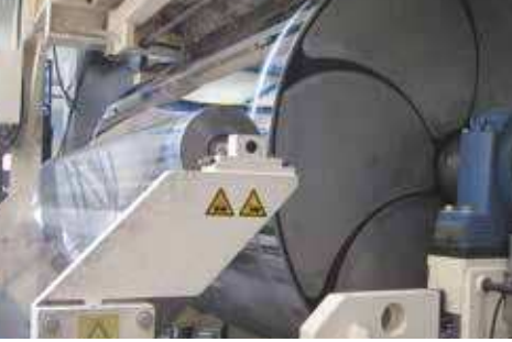
Conductor rolls for electrolytic tinning line