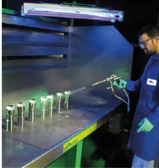
Non destructive fluorescent control