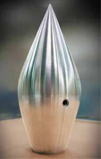
Needle for hydro energy