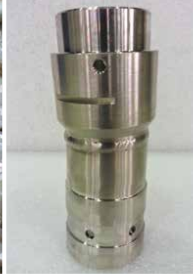
Tube crossfire combustion