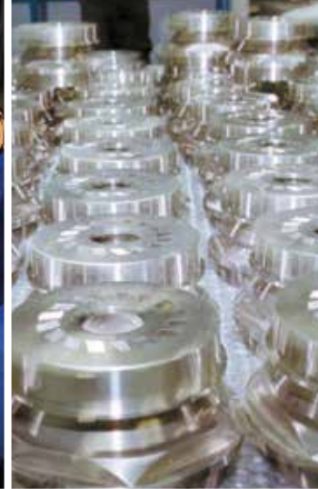
Gas turbine nozzle