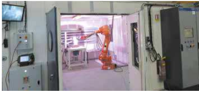
High technology Plasma Coating