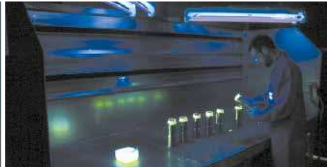
Non destructive fluorescent control