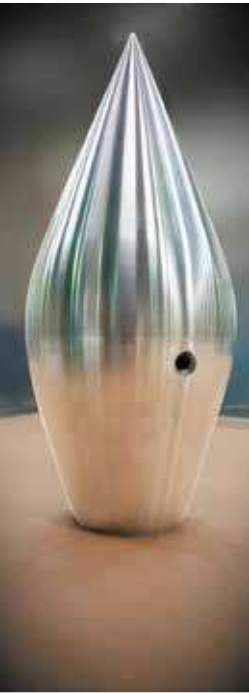
Needle for hydro energy