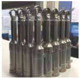
Hard chrome plated actuators body