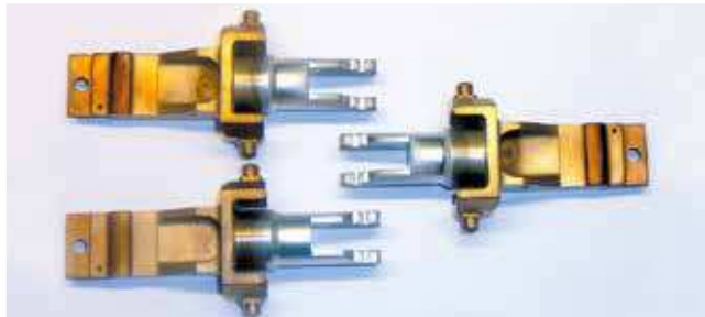
Partial hard chrome on levers