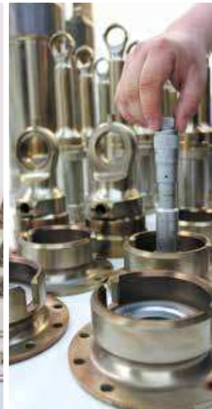
Inspection of hard chrome plated supports