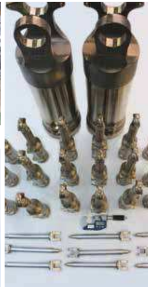
Cylinders internal diameter hard chrome plating