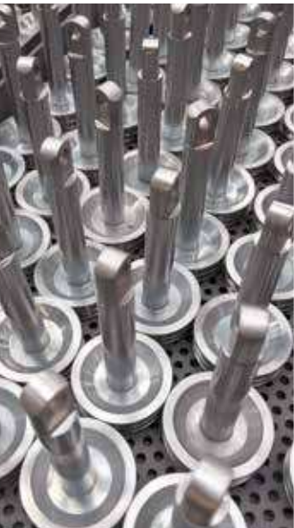
Thin hard chrome on pistons

Aerospace, Aeronautic, Defense • Energy • Iron and steel Industry • Plastic Industry • Printing Industry • Food and beverage industry • Mechanics