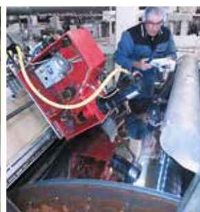
Polishing on site