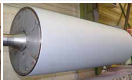
Optimum cast roll