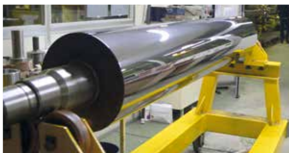
Tungsten carbide stretching roll