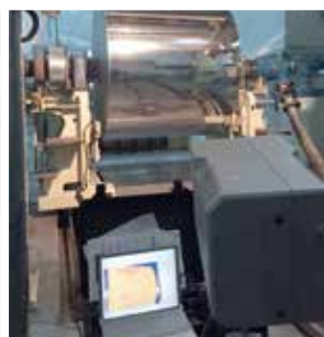
Control by thermal camera