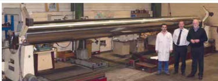
Flame treatment roller