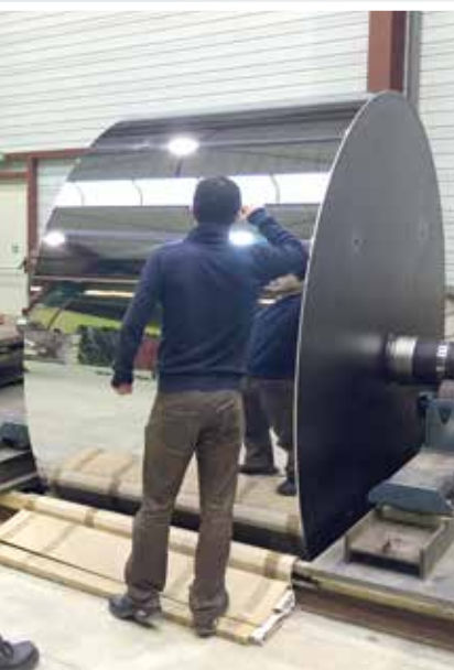
BOPP Chill roll