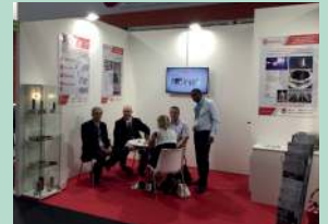
ICE EUROPE - Munich (march)