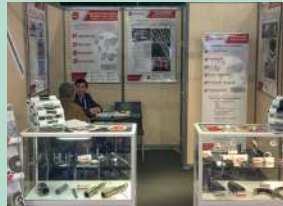
SEPEM - Douai (january)