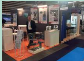
INDUSTRIE LYON (april)