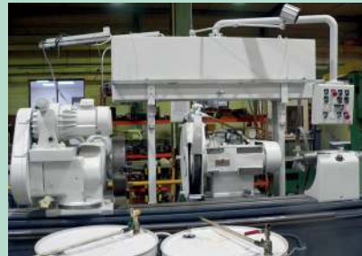
New grinding machine in Polimiroir