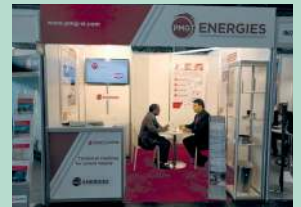
POWERGEN Cologne (june)