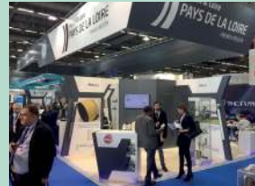
JEC WORLD - Paris (march)