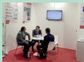
POWERGEN - Milano in June