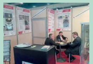
SIANE - Toulouse in October