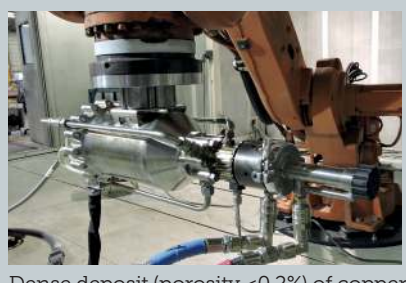
Dense deposit (porosity <0.2%) of copper produced by Cold Spray at OUEST COATING