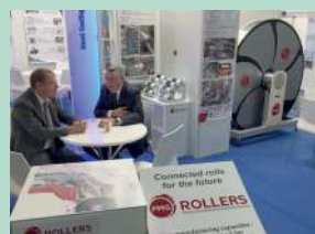
K'2016 - Düsseldorf in October