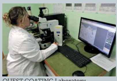
OUEST COATING Laboratory

For several years, we had been equipped with the most efficient internal control systems and we had contracts with recognized service providers enabling us to meet all the requirements related to our business.