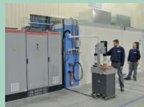
HVOF cabin at Ouest Coating

New HVOF and Plasma units in Ouest Coating and Wujiang for energy markets.