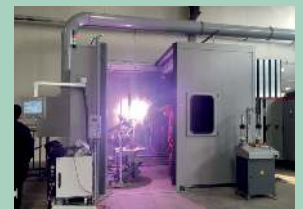
Plasma cabin at Wujiang