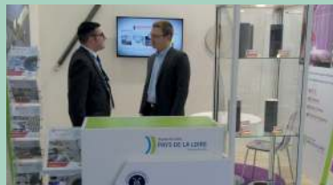
JEC (Paris) - Composites exhibition